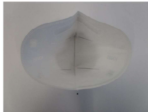
Inside View ***End of Report***